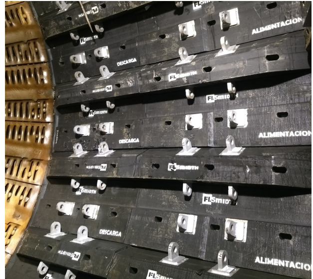
PulpMax Composite Shell Mill Liners

When it comes to optimising the productivity of your operation, quality equipment is only part of the equation. Expert service support and process know-how are also required. We have over 140 years of experience in helping customers discover potential and increase productivity. As a partner invested in your success, we leverage our combination of advanced equipment design, expert service and process know-how to achieve your goals.