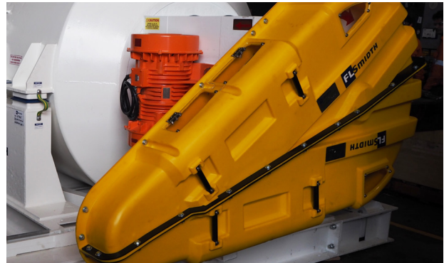
Light-weight rotomolded drive guard (VM1400/VM1500)