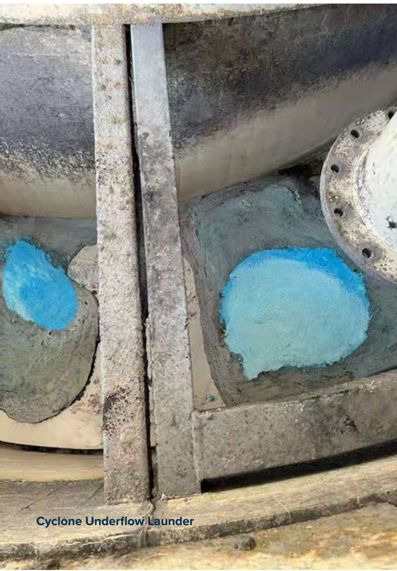
Cyclone Underflow Launder

These results don't only represent a major win for the mine's bottom line; they also provide significant sustainability benefits, notably by reducing waste. But with significant energy consumed globally in the production of wear parts for the mining industry, reducing consumption of these materials helps to reduce the industry's Scope 3 carbon emissions on the path to achieve zero-emissions mining.