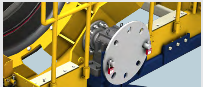
Gearbox driven rotating mechanism for full 360° rotation