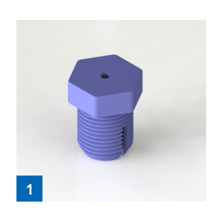
Fluidisation nozzles from 0.6 mm to 10 mm

We can engineer units for most applications. Please contact your local FLS representative regarding unit specifics and your application.