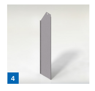
Lamella Plate spacing from 3 mm to 18 mm