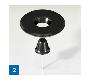
Underflow valves from 60 mm to 200 mm. *Machine sizes RC1400-HC to RC3600-HC