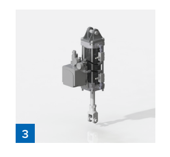
Underflow Operation. Fail Open or Fail Closed