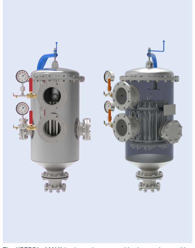
The KREBS ^{\otimes} gMAX ^{\otimes} hydrocyclone vessel is shown above with a glass body for illustration purpose only

FLSmidth A/S 2500 Valby Denmark Tel. +45 3618 1000 info@flsmidth.com