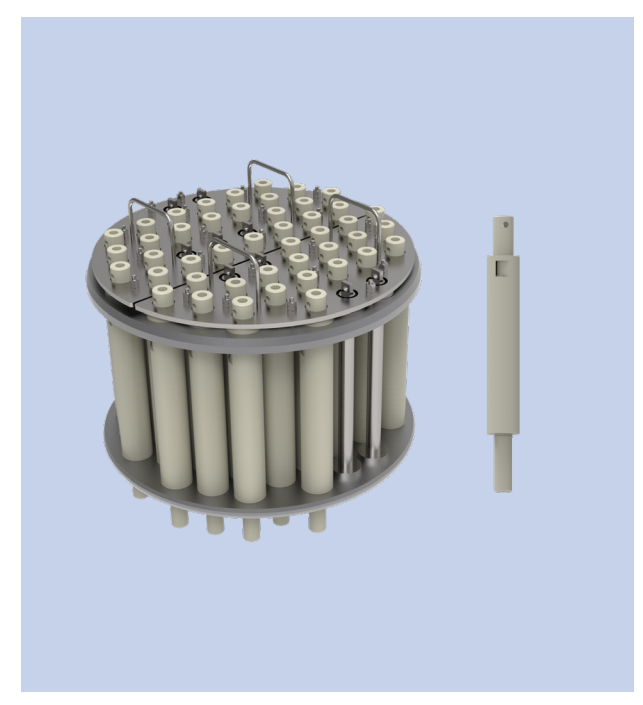
Arrangement of the ceramic cyclones within a CP vessel, shown with the upper and lower support plates and the hold-down plates