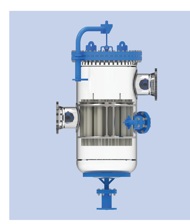
CP vessel shown with a clear exterior for illustrative purposes only