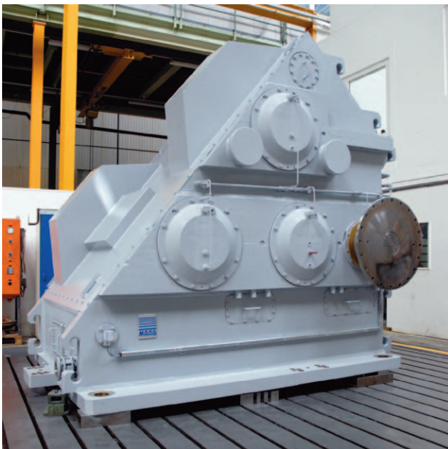
MAAG LGD ready for shipment.

axial forces. A toothed coupling between the pinion and the pinion shaft enables the pinions to self align. This ensures full tooth contact even at a small run out error of the girth gear.