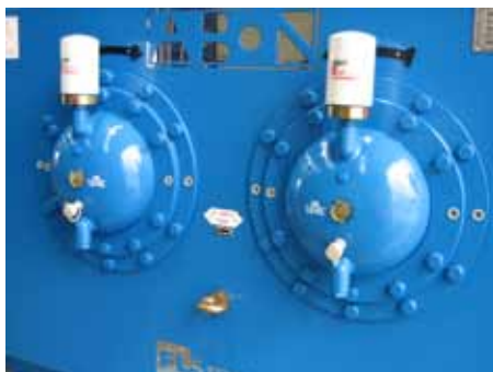
Non Drive End