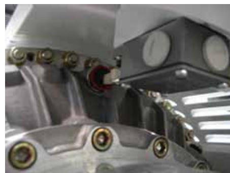
Fluid Coupling - Mechanical Thermal Switch