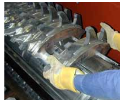
Step 3 - Teeth Slide On and Off in Rows