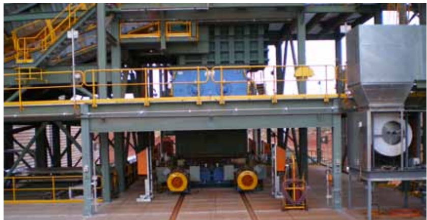
ABON 13/300CCTD Primary Sizer and 8/350CCTD Secondary Sizer installed in Iron Ore application