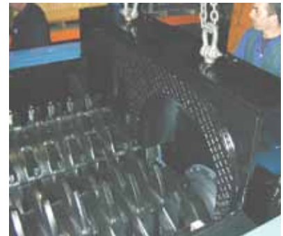
Step 1 - Remove End Wear Plate

Below are the 3 simple steps in changing out teeth segments on ABON Sizers.