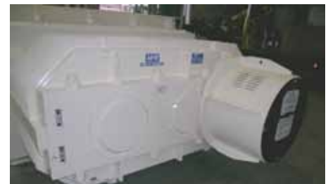
Modular Reduction Gear Box & Drive