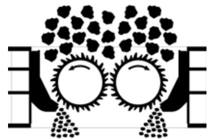
ABON Side Sizing