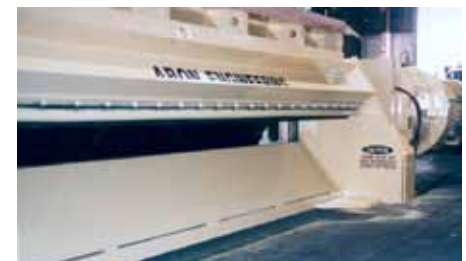
Gate to Reject System