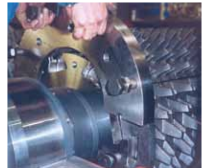
Step 2 - Remove Clamp Ring