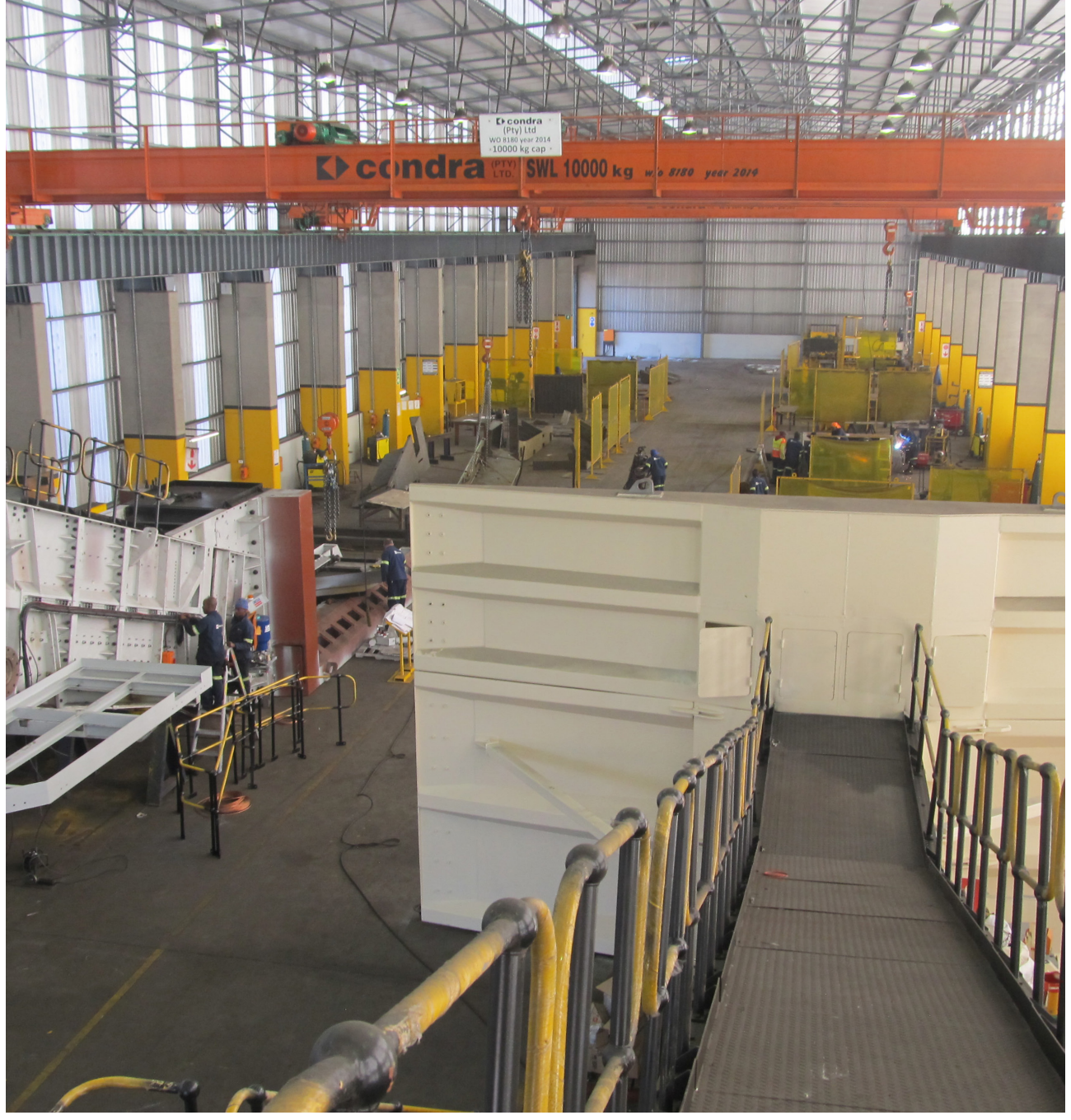
We offer full support for all of the machines we supply. Installation, commissioning, and maintenance contracts and supervision are all available to all customers.

We approach your project not as suppliers, but as partners invested in your success, ready to provide total lifecycle support to help your plant achieve its full potential.