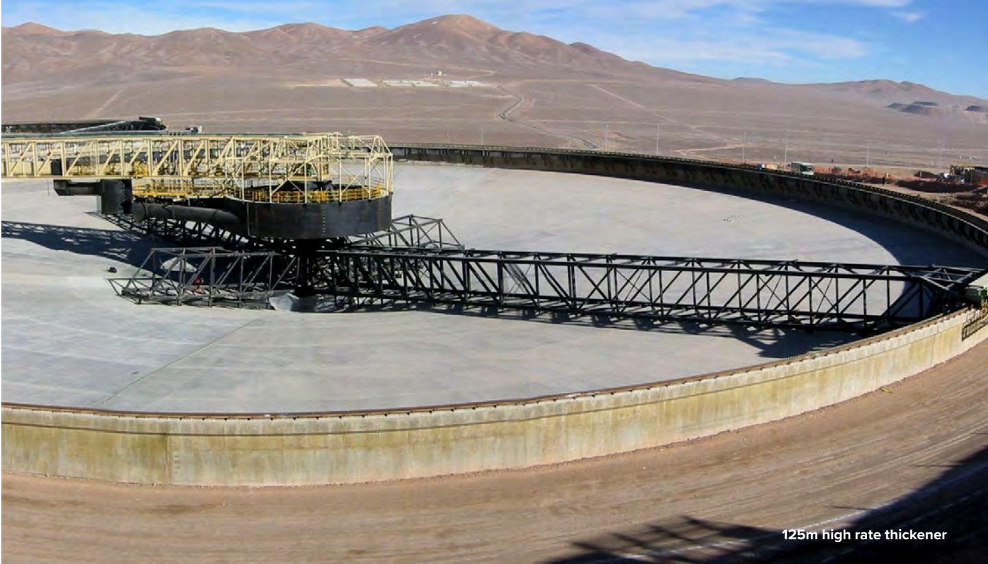
125m high rate thickener