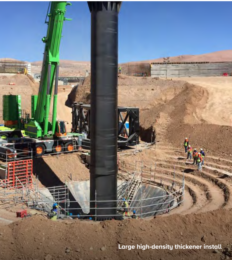
Large high-density thickener install

The pumped dilution relied on four operating P-DUC pumps to achieve the high dilution flowrates. In addition, we increased the slope of the tank floor. The thickener system demonstrated great efficiency in consistently achieving pulp dilution to a relatively low solids concentration in the thickener feedwell, which improved the flocculation and settling/sedimentation rate. We later constructed a second of these thickener systems, due to the customer's plant expansion.