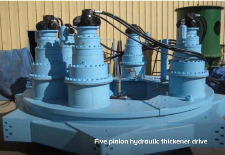
Five pinion hydraulic thickener drive

As part of the continuous development process over the past three years, and in order to not only meet their needs but also contribute to increasing productivity for our customers, our R&D engineers have used finite element analysis (FEA) and have applied the use of new materials to modify and improve the design of our C140P-6 centre drive with 10 M lb-ft of duty-rated torque. The newly launched C140P-6-SD (super-duty) drive is designed for a DRT of 12 M lb-ft, (16.2 M N-m). This drive has the highest torque on the market, and it is capable of achieving our customers’ continuously increasing demands.