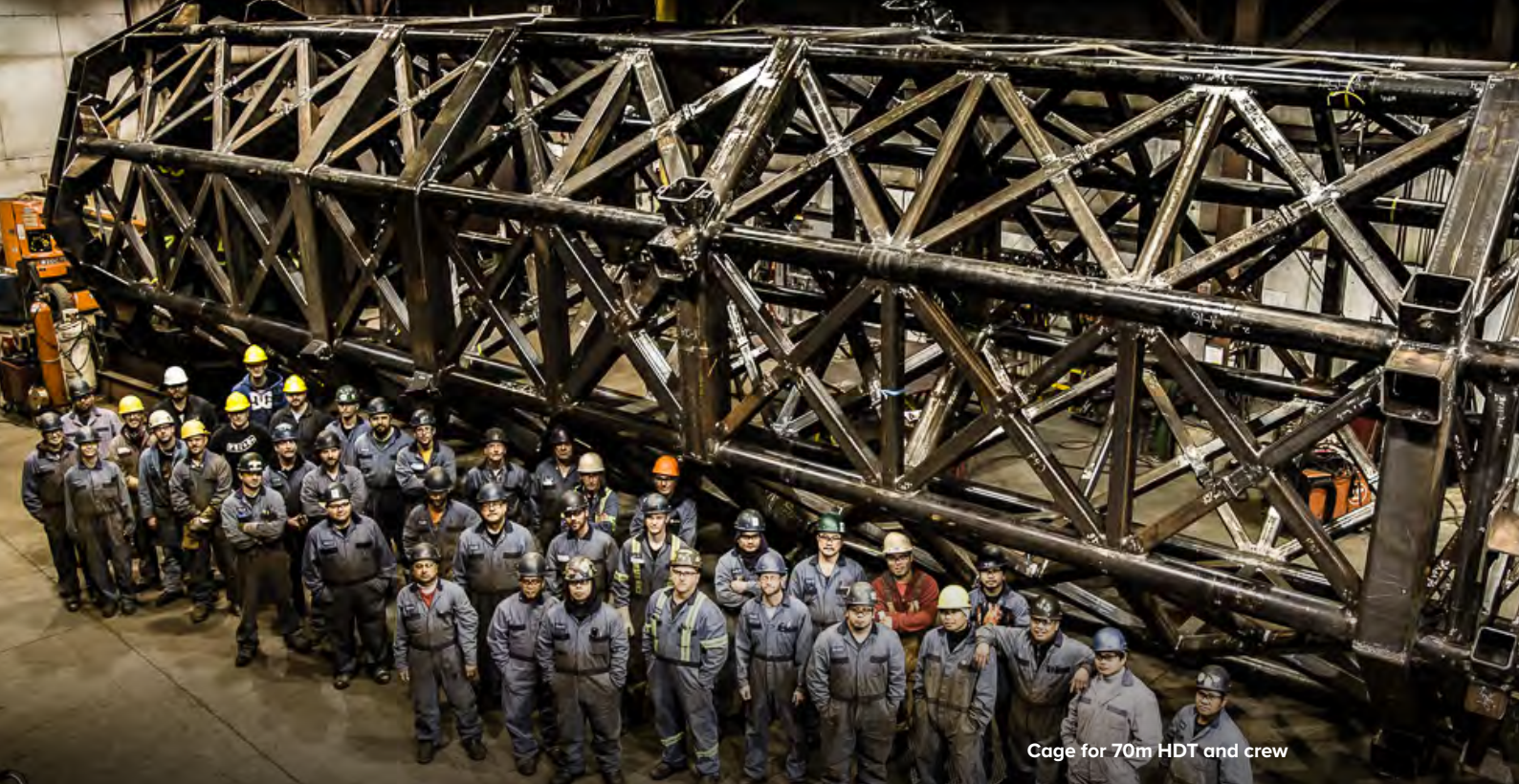
Cage for 70m HDT and crew