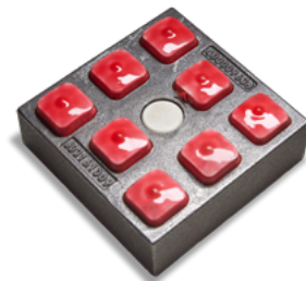
FerroCer Impact wear liner solution

Objective: To reduce frequent stoppage of the material transport system and reduce safety hazards.