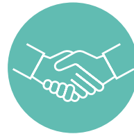
Plant acceptance and performance guarantees