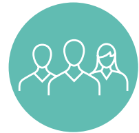
Maintenance and operations training